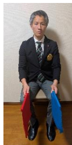
2) take back his/her flag