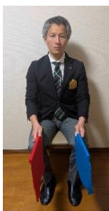
2)take back his/her flag