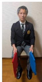
2) take back his/her flag