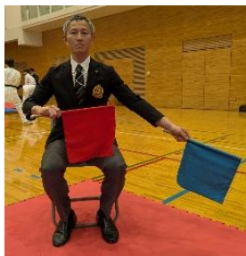
The Judge makes a double gesture (D.G.): awarding a score to AO and indicating that AKA missed the scoring area..