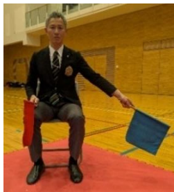
Judge appeal signal a score for AO