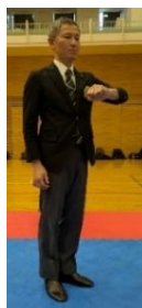
1) AO is missed